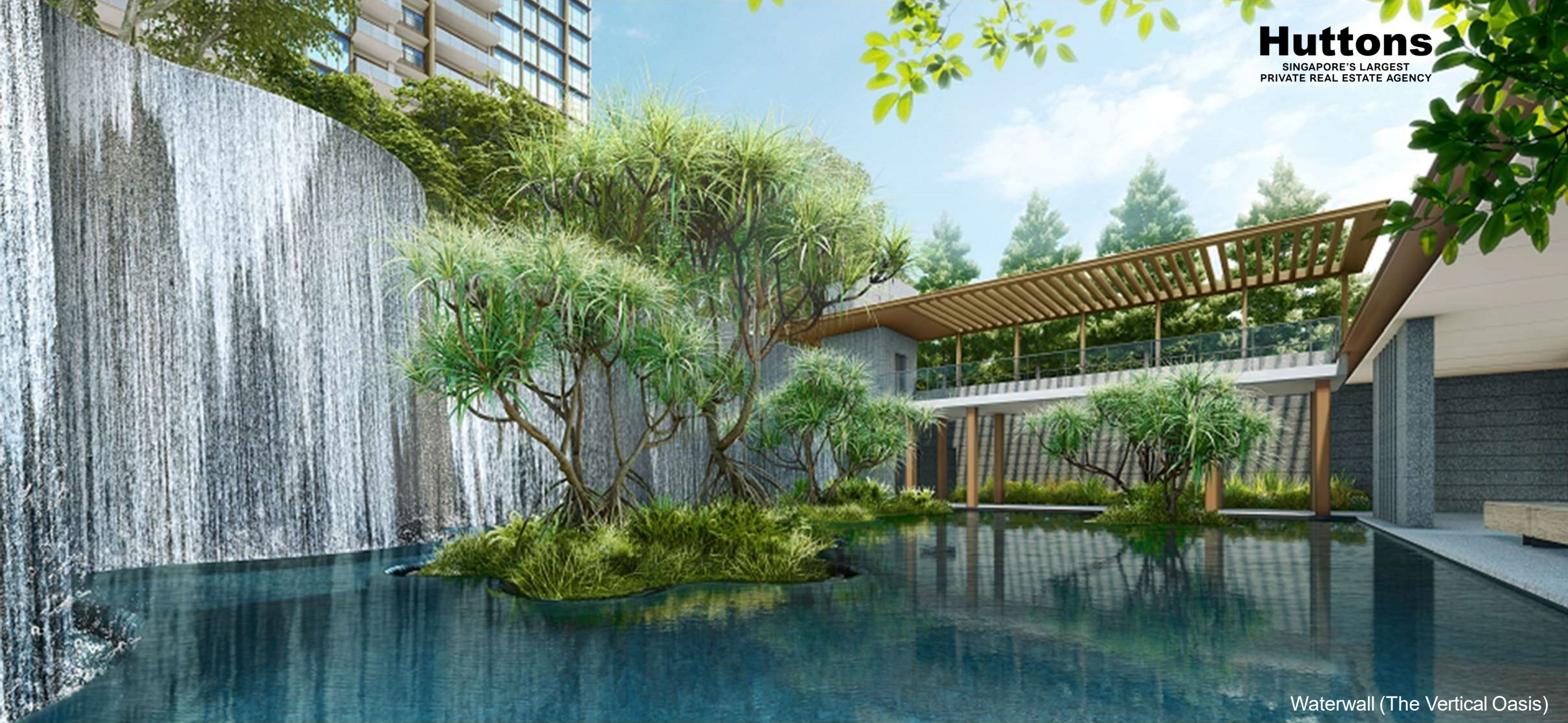
Waterwall (The Vertical Oasis)

With the residential towers occupy only 12% of site area, leaving 88% dedicated to lush landscape and facilities, the 'close to nature' setting in Pinetree Hill offers an attractive and strong work-life balance proposition for home owners.